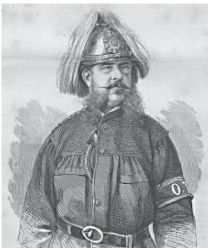
Count Ödön Széchenyi