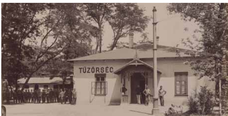
Millennium Exhibition: Building of the Fire Guard (1896)