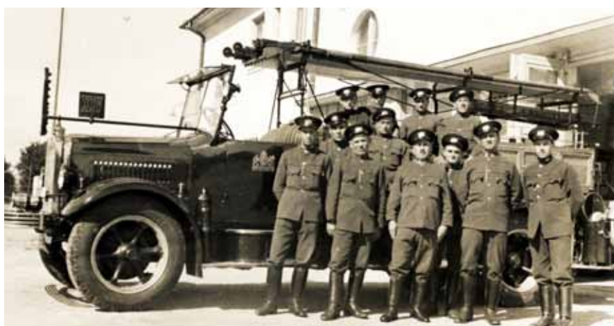
Budapest, Firefighters of the 14 th District (1940)