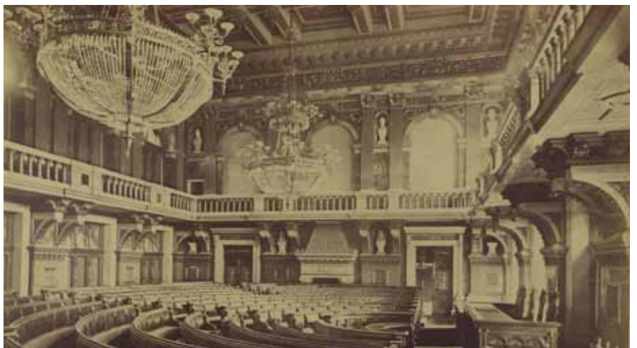
New City Hall of Pest (1870s)

Archive label: HU.BFL.XV.19.d.1.05.039