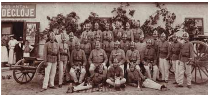
Firefighters (1908)

Hungarian National Firefighter Association had to "capitulate" at the end of World War II: it was suspended (only temporarily, but for a long time) by the Hungarian Provisional Government in 1945.